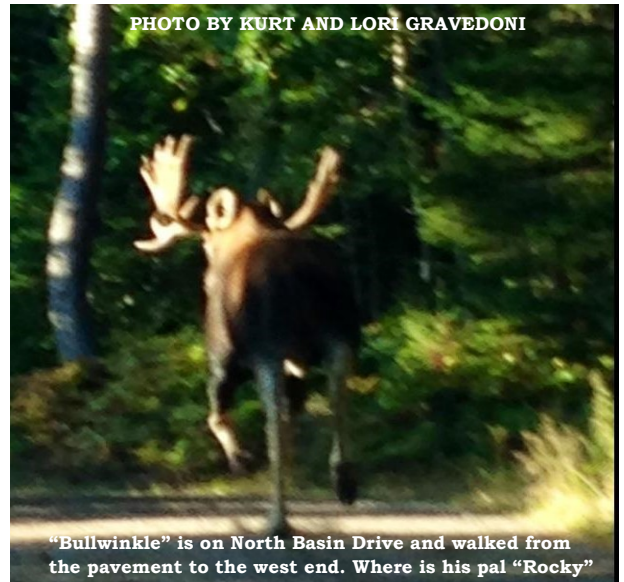
“Bullwinkle” is on North Basin Drive and walked from the pavement to the west end. Where is his pal “Rocky”

A big thank you goes out to our campers and friends for their donations to this year's fireworks display. Donations this year were $2,560.