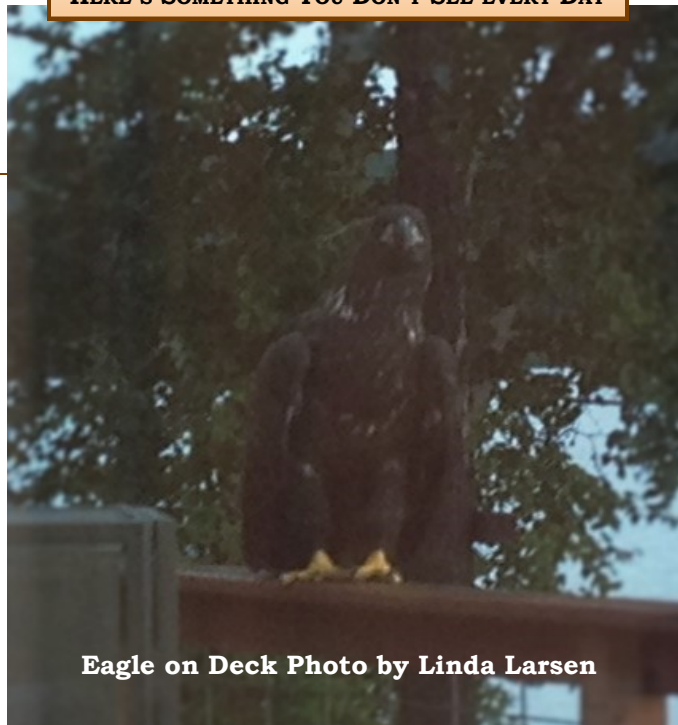
Eagle on Deck